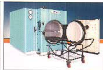
Dewaxing Autoclave Boiler