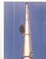
Self Supported Chimney