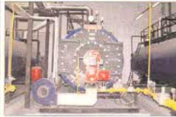
Hot Water Boiler