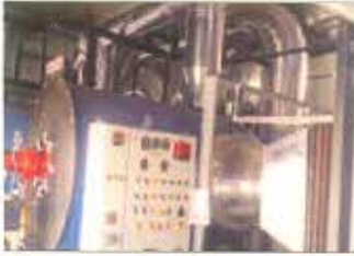
Hot Air Generator