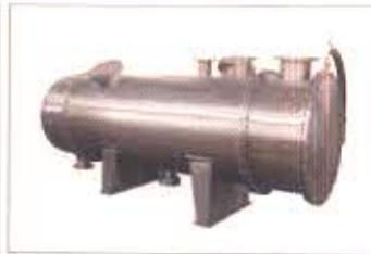
Heat Exchanger (TEMA)