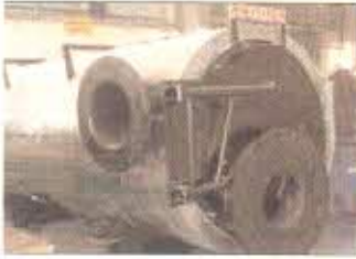
Waste Heat Boiler