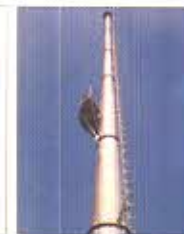
Self Supported Chimney