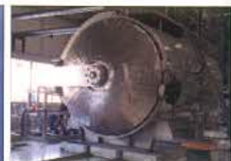
Hot Air Circulation Autoclave